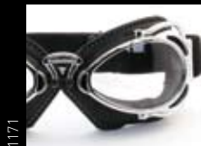
1171 BLACK LEATHER WHITE SEW Chrome

ELASTIC STRAP: An adjustable length elastic strap with an anti-slip strip ensures the strap does not move on the helmet.