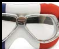
2102 FRANCE FLAG LEATHER Chrome