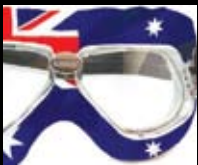
2106 AUSTRALIA FLAG LEATHER Chrome

4V: Available with chrome prescription inner frame.