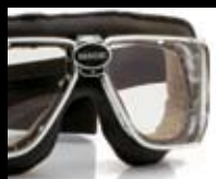
1151 BROWN LEATHER Chrome