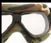
2020 CAMOUFLAGE DESERT FABRIC Black Matt