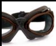
1176 BLACK LEATHER BROWN SEW Dark Brown

LENSES: Cylindrical lenses that are crafted from the highest quality scratch-proof polycarbonate. The strong, light lenses provide a high definition view and ultimate optical comfort without distortions. The lenses offer 100% UV protection.