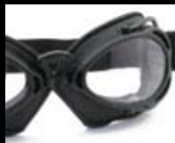
1170 BLACK LEATHER BLACK SEW Black Matt