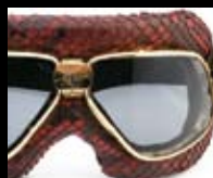
2001 RED PYTHON LEATHER Brass