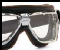
1173 BLACK LEATHER ORANGE SEW Chrome

LENSES: Cylindrical lenses that are crafted from the highest quality scratch-proof polycarbonate. The strong, light lenses provide a high definition view and ultimate optical comfort without distortions. The lenses offer 100% UV protection.