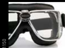
1150 BLACK LEATHER Chrome

ELASTIC STRAP: An adjustable length elastic strap with an anti-slip strip ensures the strap does not move on the helmet.