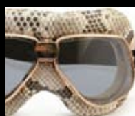
2002 WHITE PYTHON LEATHER Pink Brass