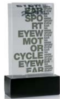
VISUAL DISPLAY: Interchangeable internal transparent film