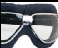
2038 BLUE FABRIC Chrome