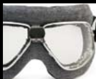
2031 LIGHT JEAN FABRIC Chrome