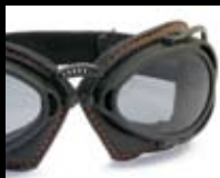
1174 BLACK LEATHER ORANGE SEW Black Matt