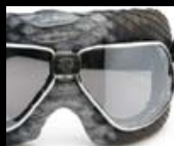
2000 BLACK PYTHON LEATHER Chrome