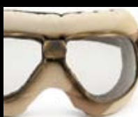
2121 CAMOUFLAGE DESERT FABRIC Antique Bronze Brushed