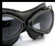
BLACK LEATHER ORANGE SEW Black Matt