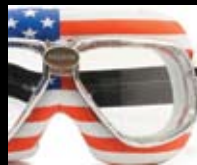
2105 USA FLAG LEATHER Chrome