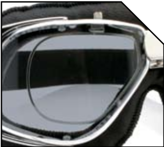
Chrome prescription inner frame

FRAME: The wadded support is lined with genuine leather for a comfortable fit. Similar wear-resistant leather is used on the exterior covering for superior wind and water protection.