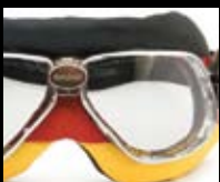
2103 GERMAN FLAG LEATHER Chrome