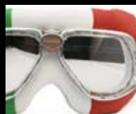
2101 ITALY FLAG LEATHER Chrome

LENSES: Cylindrical lenses that are crafted from the highest quality scratchproof polycarbonate. The strong, light lenses provide a high definition view and ultimate optical comfort without distortions. The lenses offer 100% UV protection.