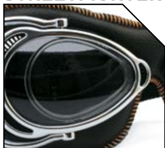
Chrome prescription inner frame

DOUBLE FRAME: A double crush-proof plastic frame provides twice the protection and durability.