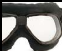
2033 BLACK METALLIC FABRIC Black Matt