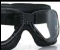
1178 BLACK LEATHER Shiny Ruthenium

PACKAGING: Display box and soft carry case.