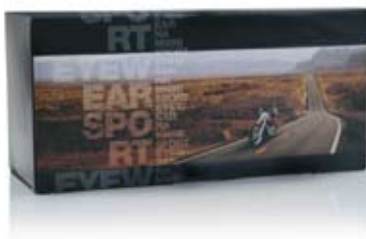
CASE: Cardboard case available in M, XL sizes