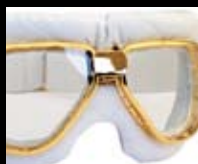
2037 WHITE FABRIC Matt Brass