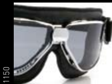
1150 BLACK LEATHER BLACK SEW Chrome

ELASTIC STRAP: An adjustable length elastic strap with an anti-slip strip ensures the strap does not move on the helmet.