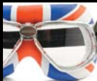
2104 ENGLAND FLAG LEATHER Chrome