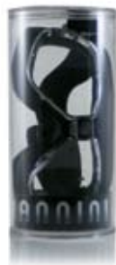
PLEXIGLASS DISPLAY TUBE: Transparent display tube in L, XL sizes