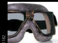
1182 ANTIQUE BROWN LEATHER Antique Brass Satin