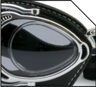
Chrome prescription inner frame

DOUBLE FRAME: A double crush-proof plastic frame provides twice the protection and durability.