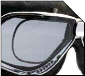
Chrome prescription inner frame

FRAME: Designed for durability and high performance in all weather conditions.