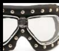
2010 BLACK LEATHER WITH STUDS Chrome

LENSES: Cylindrical lenses that are crafted from the highest quality scratchproof polycarbonate. The strong, light lenses provide a high definition view and ultimate optical comfort without distortions. The lenses offer 100% UV protection.