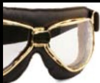
1180 BROWN LEATHER Brass

LENSES: Cylindrical lenses that are crafted from the highest quality scratch-proof polycarbonate. The strong, light lenses provide a high definition view and ultimate optical comfort without distortions. The lenses offer 100% UV protection.